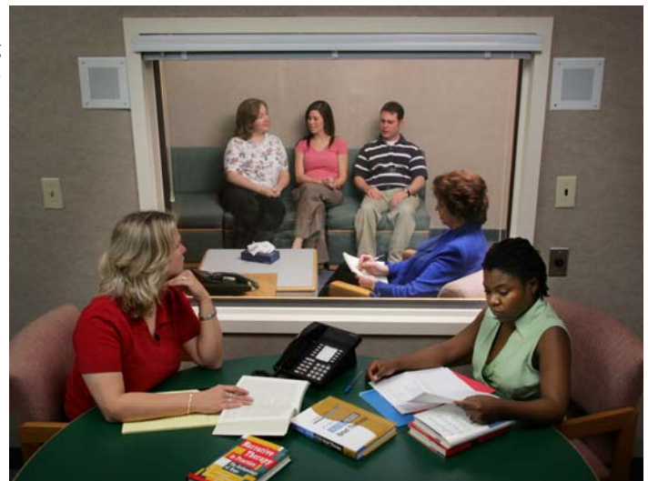
Brief Therapy Institute at NSU

students to understand how families engage with one another, how they communicate, and how relationship patterns may interfere with maintaining strong connections to one another.