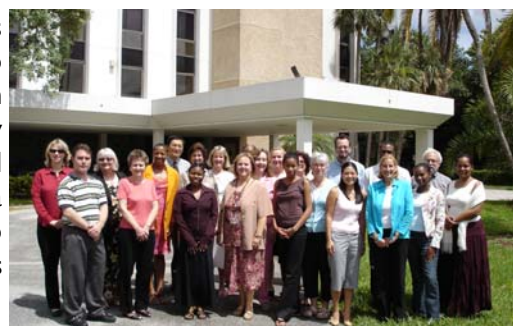
SHSS Faculty and Staff on the East Campus

The 2005-2006 academic year has already brought about many historic changes for SHSS. On August 1 st the school relocated from the East Campus in Fort Lauderdale to the Main Campus in Davie. SHSS now shares the Maltz Building with the Center for Psychological Studies (CPS). The new Master’s degree in College Student Affairs (CSA) also launched this Fall with a strong incoming group of students. Throughout the upcoming