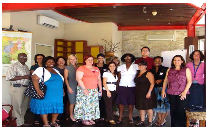
DCAR Global Course students providing CR Training in Suriname.