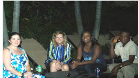
Fall RI Events